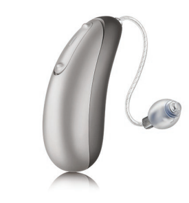
Moxi Jump R RECHARGEABLE